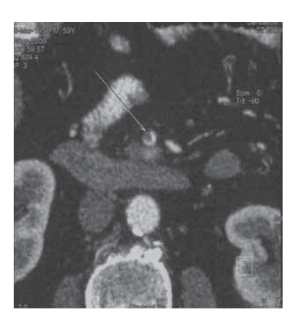
Figure 2. MSCT scan of the embolisation site.

with emboli most commonly originating in the left atrium, particularly in patients with AF. Emboli to the SMA most commonly lodge at points of normal anatomic narrowing usually just distal to the origin of major branches, and may partially or completely occlude the vessel's lumen causing mesenteric ischemia. (1,2) Clinical suspicion, prompt diagnosis and treatment before the onset of bowel infarction may highly reduce mortality.